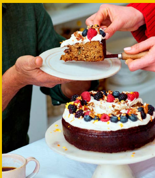
Carrot Cake with Tahini Orange Frosting