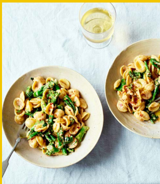
Broccoli and Walnut Orecchiette (V)