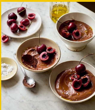
Chocolate Olive Oil Mousse (V)