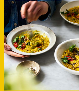
Sweetcorn and Spinach Dhal (V)