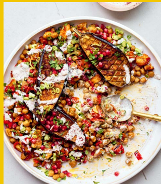
Roasted Aubergine Traybake