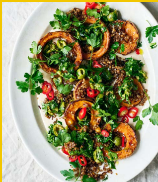
Roasted Squash with Toasted Grains (V)

Extracted from The Food for Life Cookbook by Tim Spector (Vintage, £28). All photography by Issy Croker.