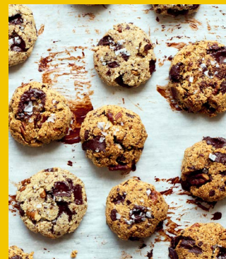
Pecan Chocolate Cookies (V)