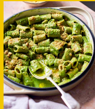
Creamy Kale Pasta (V)